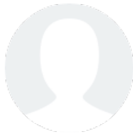
Tim Besaw Properties, Ltd