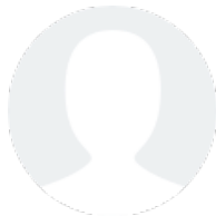
Tim Besaw Properties, Ltd