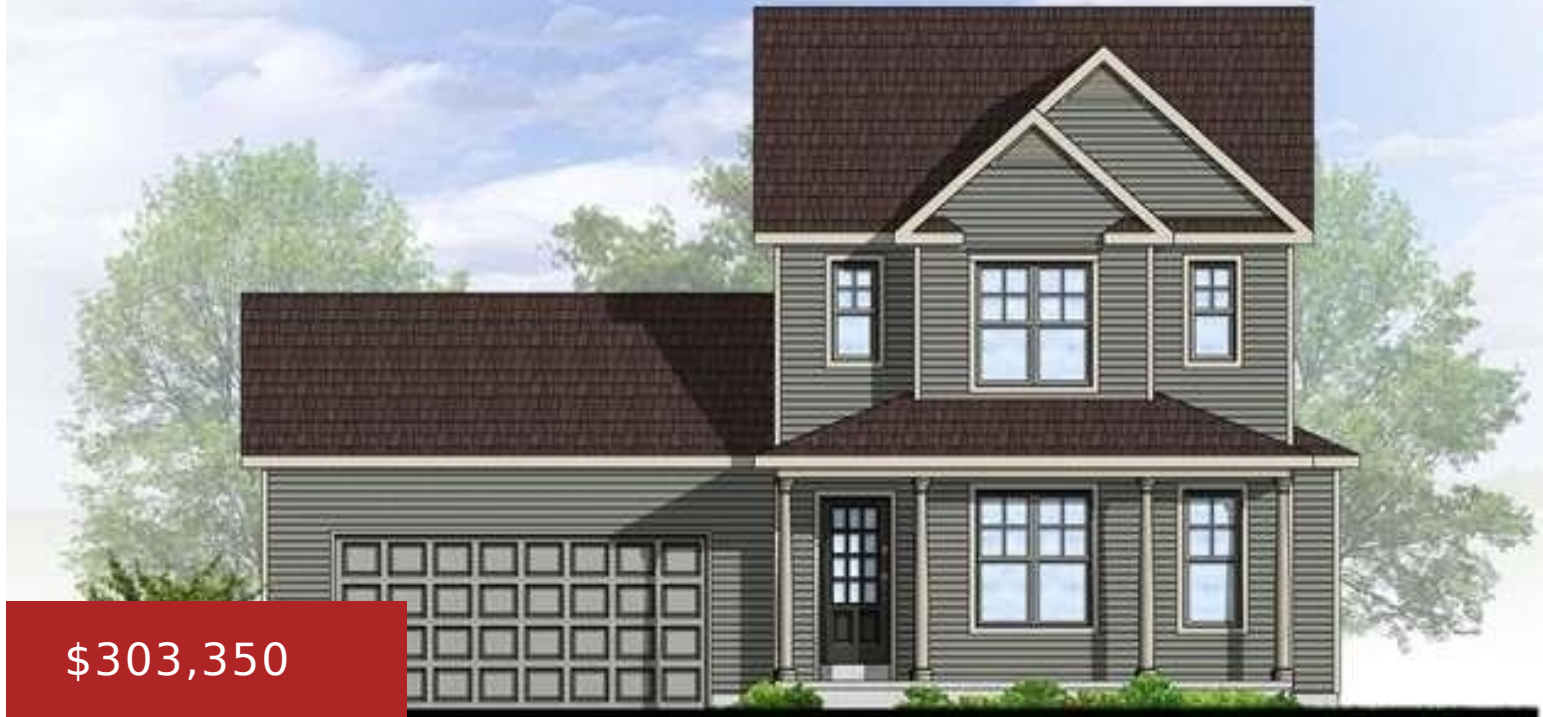
REPRESENTATIVE MODEL FOR COMPARISON