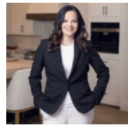
Sarah Adashun Jones, Inc.