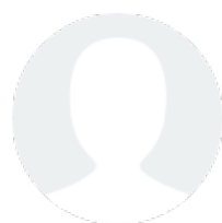
David Roberts Homes and Real Estate