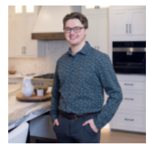
Glenn Adashun Jones, Inc.