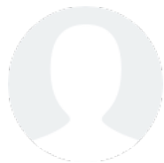
Ben Ben Bartolazzi Real Estate, Inc