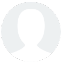
Ronald Infiniti Realty LLC