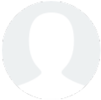
Ronald Infiniti Realty LLC