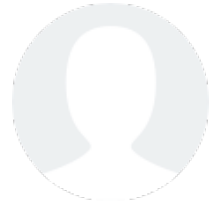
Shar Resource One Realty, LLC