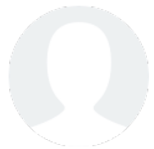
Thomas Resource One Realty, LLC