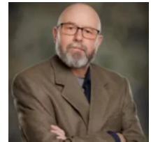
Joe Adashun Jones, Inc.