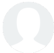
Robin First Weber, Inc.