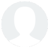
David Roberts Homes and Real Estate