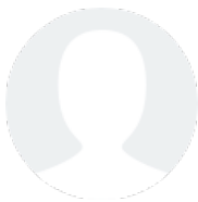
James Roberts Homes and Real Estate