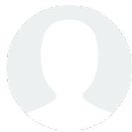
James Roberts Homes and Real Estate