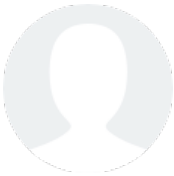
Ryan Kos Realty Group