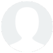
Ryan Kos Realty Group