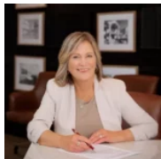
Jan Adashun Jones, Inc.