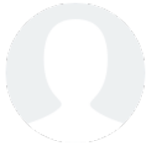
Mike Acre Realty, Ltd.