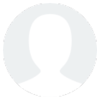
David Ruesch Realty