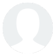
Tyler Beckman Properties