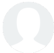
Kelsey Coldwell Banker Real Estate Group