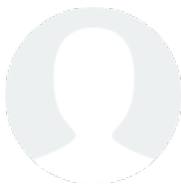
Michele Shorewest, Realtors