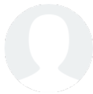
Chris Dallaire Realty