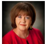
Vickie Adashun Jones, Inc.