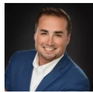
Kevin Adashun Jones, Inc.