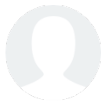
Brian Beckman Properties