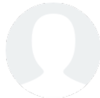
Tim Besaw Properties, Ltd