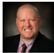
Chris Adashun Jones, Inc.