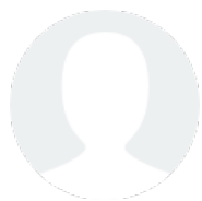
Mike Dallaire Realty