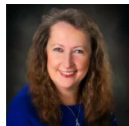
Bonnie Adashun Jones, Inc.