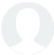
Brian Sweetwater Real Estate, LLC

Heating and Cooling = Baseboard. Condominium Living Space = Entry On Ground Level. Open concept condo on 1st floor. Convenient Ashwaubenon location not far from Lambeau Field. Nice setup for carefree living with washer/dryer inside living quarter, fenced patio, and basement storage with water softener. Great condition.