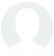
Steven Match Realty Group, LLC