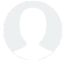
Adam Resource One Realty, LLC