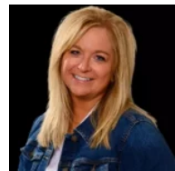
Colette Adashun Jones, Inc.