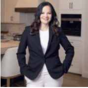
Sarah Adashun Jones, Inc.