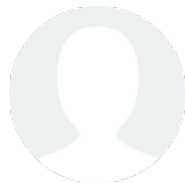
Joy LPT Realty