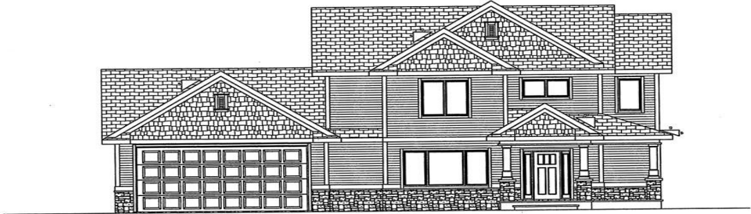
FRONT ELEVATION SCALE 1/8" = 1'-0"

2326 Walnut Hill Lane, Sun Prairie, WI, 53590