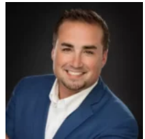
Kevin Adashun Jones, Inc.