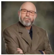
Joe Adashun Jones, Inc.