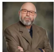
Joe Adashun Jones, Inc.