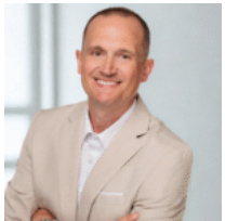
Scott Adashun Jones, Inc.