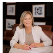
Jan Adashun Jones, Inc.