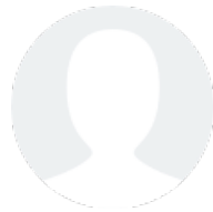
Jerrilynn Fireside Realty, LLC