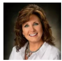
Debra Adashun Jones, Inc.