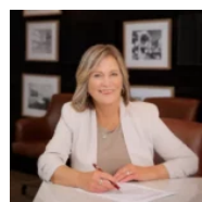
Jan Adashun Jones, Inc.