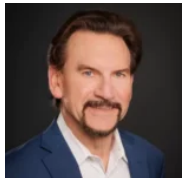
Frank Adashun Jones, Inc.

Quad-level home with 3 bedrooms, master bedroom has private bathroom. eat in kitchen, living room with patio doors, lead out to deck overlooking fenced yard. New carpet and fresh paint. This is a Fannie Mae HomePath property.