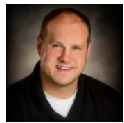
Brent Adashun Jones, Inc.

Make this your new home! Hard to find ranch located in a desired North Fond du Lac location. 2 bed , 2 bath ,with a finished lower level for additional space or 3rd bedroom. New garage door, and full appliance package included.