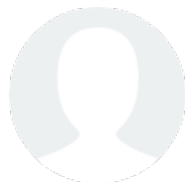
Tiffany Coldwell Banker Real Estate Group