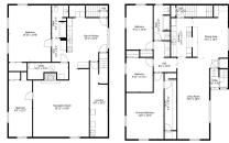
TOTAL SQ. FT. 1,800 SQUARE FOOTAGE IS BASED ON THE FOLLOWING ASSUMPTIONS: 1. ALL MEASUREMENTS ARE TAKEN FROM THE EXTERIOR OF THE BUILDING. 2. ALL MEASUREMENTS ARE TAKEN FROM THE EXTERIOR OF THE BUILDING. 3. ALL MEASUREMENTS ARE TAKEN FROM THE EXTERIOR OF THE BUILDING.