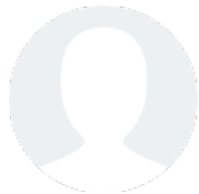
David Roberts Homes and Real Estate