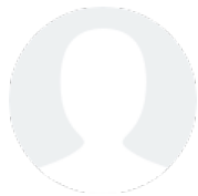
James Roberts Homes and Real Estate