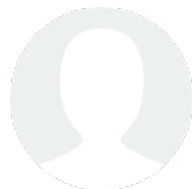
Sheryl Adashun Jones, Inc.