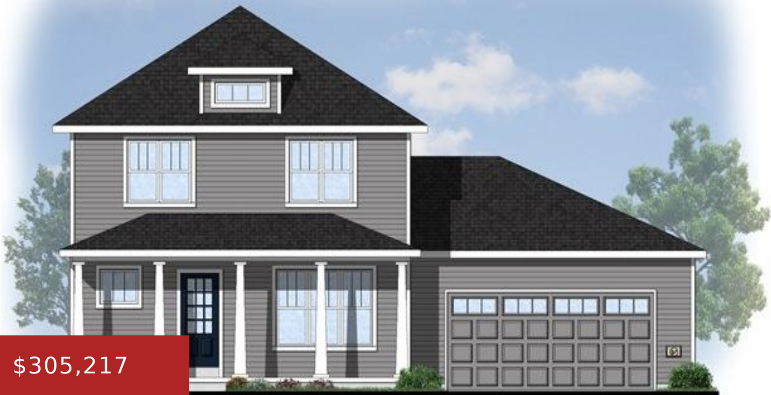
REPRESENTATIVE MODEL FOR COMPARISON