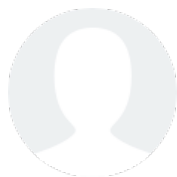
Mike Dallaire Realty