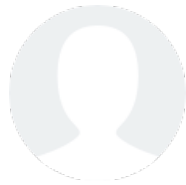
Stephanie Acre Realty, Ltd.