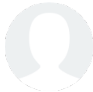
Brian Beckman Properties